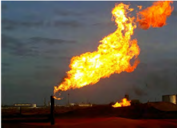
Figure 3. Natural gas flare

Shale gas extraction and processing can generate a wide variety of air pollutants that vary in type and amount throughout the production process. These emissions differ from that of conventional oil and gas development in that there are more extensive well completion activities, including hydraulic fracturing, along with a greater density of wells and intensity of trucking activities. Table 1 itemizes the main air pollutants (along with their chemical symbols) that can be emitted during different stages of shale gas production, along with potential health effects from excessive exposures.