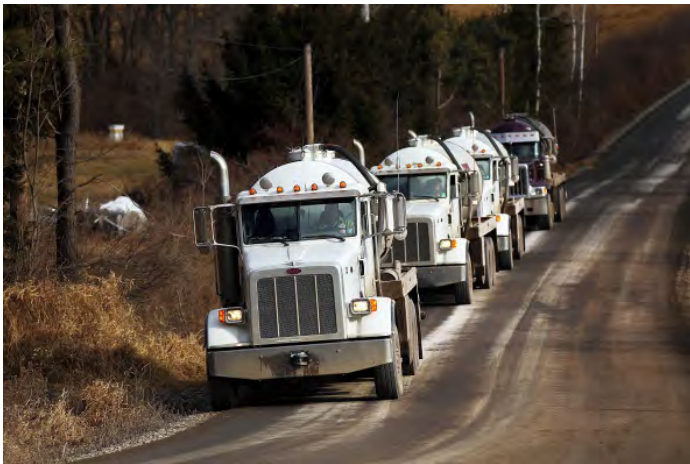
Figure 8. Shale gas trucks carrying water in a hydraulic fracturing site (Creative Commons, National Public Radio 74 )

Materials must be transported by truck to build the well pad and its surrounding infrastructure. Hydraulic fracturing of shale gas wells requires delivery of large amounts of water, sand, and chemicals and use of large pumper trucks on site. Traffic load is greatest during well pad construction, drilling, and well completion (readying the well for production). Truck traffic can damage rural roads and increase congestion and the risk of motor vehicle accidents, as well as contribute to elevated exposures of vehicle exhaust (including diesel emissions), noise, and dust. A health impact evaluation in a community in Colorado concluded that traffic noise in the range of 30 to 70 decibels has been associated with a number of health effects including sleep disturbance, diminished school performance, and hypertension. It was recommended that roads be built to shunt industrial traffic outside the community to reduce associated safety hazards, diesel emissions, and noise. 73