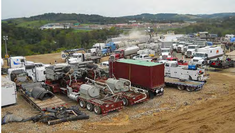
Figure 1. A hydraulic fracturing operation at a Marcellus Shale drill pad in Pennsylvania, US, showing pumps, generators, fuel, chemicals, sand, pipes, service trucks