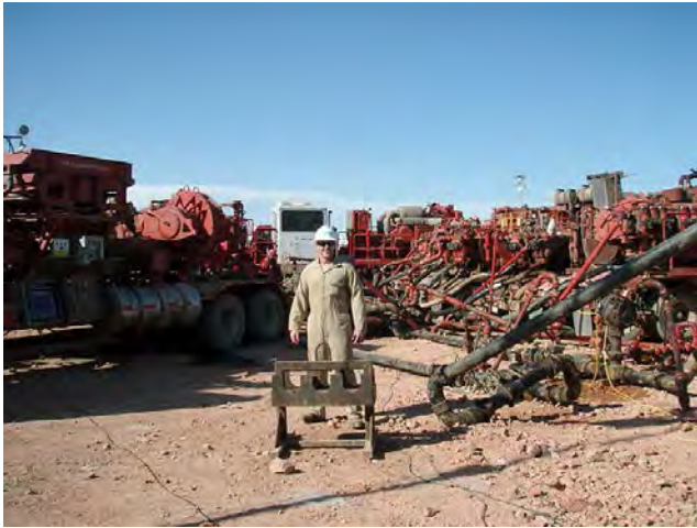
Figure 9. Worker poses while hydraulic fracturing is undertaken in the Bakken oil formation, North Dakota.